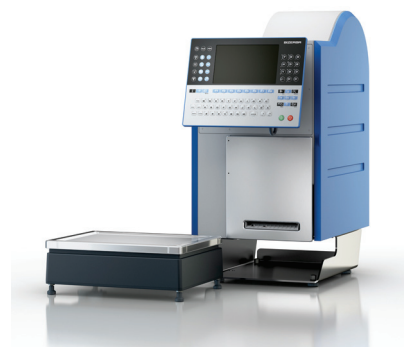
GLP-Imaxx - table-top version with scale

Settings and maintenance of the printer unit can be made without need of any tools - reducing costs and increasing print quality. The new PC-based hardware provides more memory space and fast label data processing. By means of an USB port it is easy to run data back-ups and to buffer statistical data. The operating terminal GT-7C with color display can be operated ergonomically and thus reduces operating errors. Optionally, an operating terminal with color display is available.