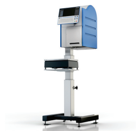
GLP-Imaxx - standing mount with scale