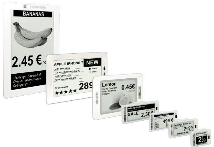
SmartTAG HD label range (graphic displays)

Technical specification is subject to change without prior notification.