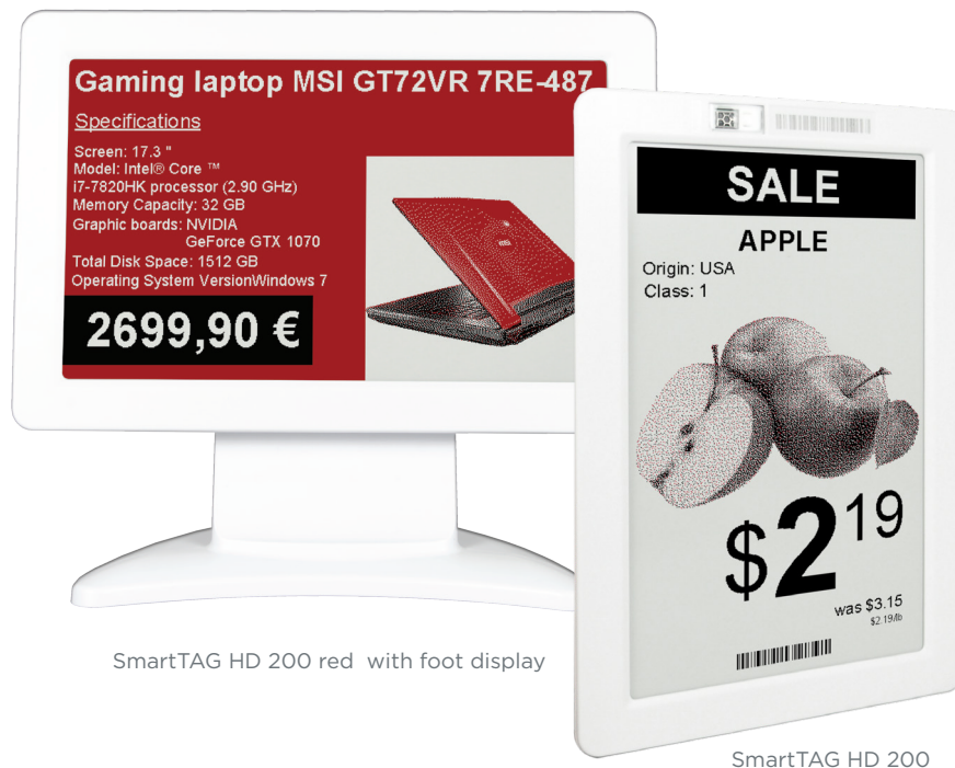
SmartTAG HD 200 red with foot display